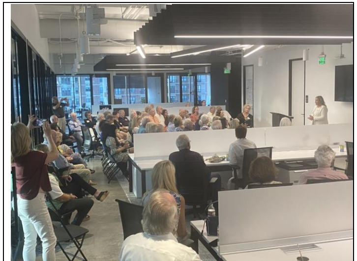
Annual Meeting in Compass 10 th floor offices