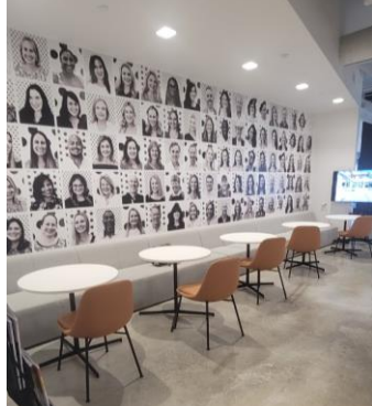
Compass Real Estate Kitchen and Dining Room