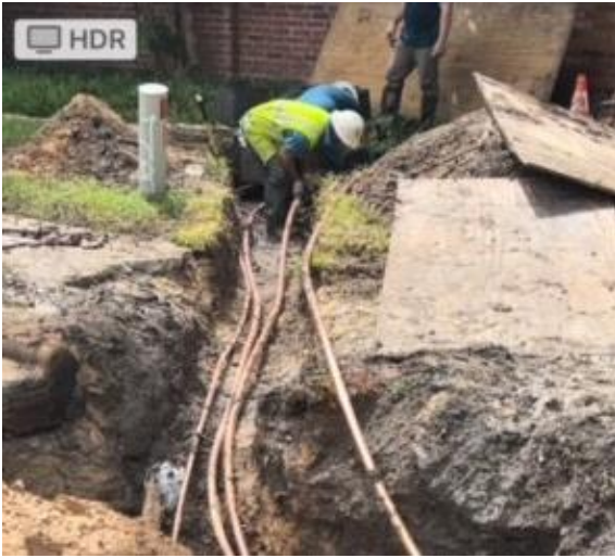
Copper water pipes connecting meters to the new water lines